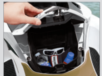
Glove box storage