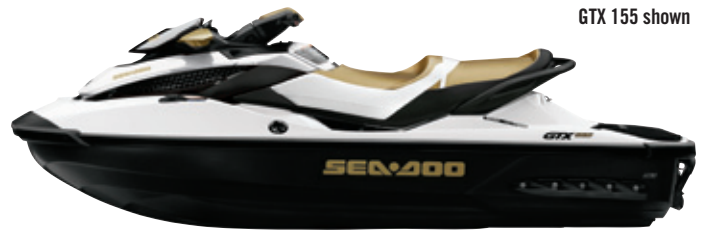
GTX 155 shown