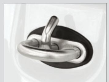
Ski tow eye

The Sea-Doo® GTX 155 watercraft is more fuel-efficient than most competitive models. iControl™ technologies provide a completely intuitive experience, and for even more power, the GTX 215 model comes with a supercharged engine.