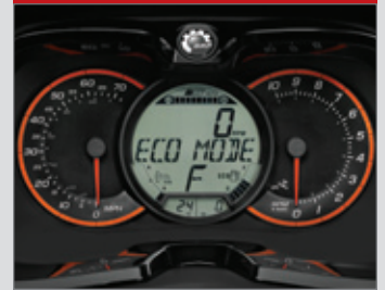
Driving Center including ECO mode