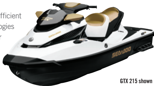
GTX 215 shown

The Sea-Doo® GTX 155 watercraft is more fuel-efficient than most competitive models. iControl™ technologies provide a completely intuitive experience, and for even more power, the GTX 215 model comes with a supercharged engine.