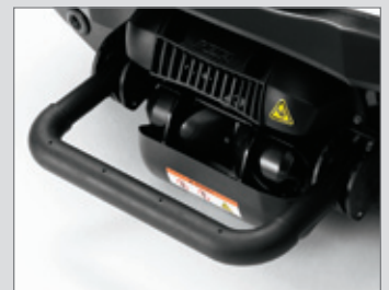
Fold-down reboarding step