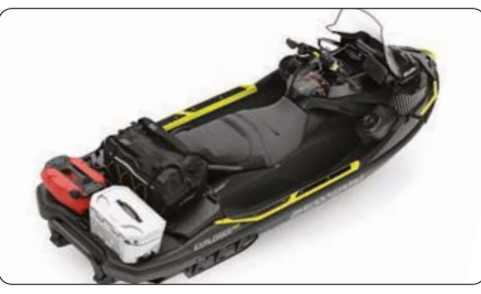
Extended Riding Comfort With extended riding duration in mind, the Explorer Touring seat and knee pads, adjustable riser handlebars and gunwale footrests provide ultimate extended riding comfort.

An industry-first that reduces noise and fatigue associated with prolonged wind pressure whilst also protecting against splashing and salt water exposure when riding offshore.