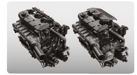
ROTAX® 1630 ACE<sup>™</sup> - 170 Two engine options: the 125kW (170hp) boasts naturally aspirated punch with optimal fuel economy or opt for the 169.16 kW (230hp) engine with a supercharger and external intercooler, optimized to run on regular fuel.

Keep extra gear dry and easily accessible with this 100 L. bag. This exclusive LinQ compatible accessory is waterproof, functional and portable. It can be stacked on the LinQ plate/LinQ accessories or carried as a backpack.