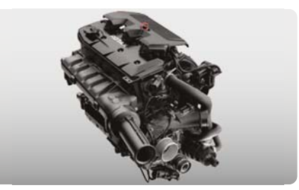
ROTAX<sup>®</sup> 1630 ACE<sup>™</sup> - 230 ENGINE This powerful engine comes standard with a supercharger and external intercooler. It is optimized to run on regular fuel, which lowers fuel costs.

Exclusive quick-attach system on the largest swim platform in the industry that allows for easy installation of accessories.