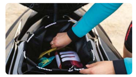
Large front storage An impressive 144 L. of sealed storage space allows riders to safely stow belongings while riding.

©2024 Bombardier Recreational Products Inc., (BRP). All rights reserved. (a), TM and the BRP logo are trademarks of Bombardier Recreational Products Inc. or its affiliates. All product comparisons, industry and market claims refer to new sit-down PWC with 4-stroke engines. Watercraft performance may vary depending on, among other things, general conditions, ambient temperature, altitude, riding ability and rider/ passenger weight. Testing of competitive models done under identical conditions. Because of our ongoing commitment to product quality and innovation, BRP reserves the right at any time to discontinue or change specifications, price, design, features, models, or equipment without incurring any obligation. †Garmin is a trademark of Garmin Ltd. or its subsidiaries.