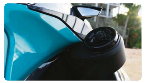
VTS<sup>™</sup> (Variable Trim System) Provides handlebar-activated settings so riders can easily find the ideal trim for varying conditions.