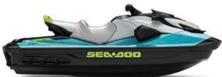
● Teal Blue and Manta Green