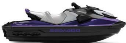
● NEW Midnight Purple