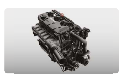
ROTAX® 1630 ACE™- 130 ENGINE

Exclusive to Sea-Doo®, iBR® stops the watercraft sooner and provides more control and maneuverability at low speeds and in reverse.